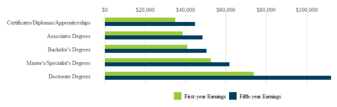
Figure 1. Median First- and Fifth-Year Earnings by Credential

In addition to earnings outcomes, we also look at the number of graduates by credential. Figure 2 shows the number of graduates over the same five-year period, which shows that the Associates degree is the most commonly awarded postsecondary credential in Florida (approximately 36% of all certificates/degrees awarded), followed closely by the Bachelor's degree (34%). In addition, a significant number of students graduated from a certificate, diploma, or apprenticeship program (20%). Graduates from advanced degree programs represent the smallest group of total graduates (11%).